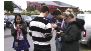
Figure 3. Players from left to right: LT, SS, CR, PC. LT walking around the team, her body orientation suggesting attempts to leave the group.

[0:00] After a target drop off, LT and SS joined PC and CR at drop off zone. [0:24] HQ sent message A: LT, if you think you have the stamina to run to 10 around the north of the lake do so now with a firefighter [0:28] Agent instruction received: NK, LT -> 16 LT: They said ((reads out aloud HQ message A)) [0:35] CR ((facing LT)): Shall we go get 10 LT: Mine is 16 [0:38] HQ sent message B: Avoid 17 at all costs (...) I'd avoid 10, too. CR: ((read out HQ message B)) avoid 10 now. [0:55] New agent instruction received: NW, LT -> 15 LT: 15! [Fig. 3] LT keeps walking and turning back and forth from others. PC and SS discuss next steps, LT does not engage in the discussion with them. [1:12] SS ((facing PC)): Shall we go get 19? ((turning towards LC and CR)) are you going to 10 or something? CR: Eh::, HQ said no. [referring to message B] [1:24] SS and PC decide to go for target 19, and leave. [1:29] NW sent message: LT where you CR ((facing LC)): Are you LT? LT: Yes. CR: NW is looking for you. LT: Yah thanks. ((turning away from CR)) Ah::: I will go towards them. ((starts walking)) CR: Okay. Do you want company? LT: ((turning back towards CR)) Yeah. CR and LT leave drop off zone together to find NW.