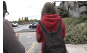
Figure 4. AW (right) leads the way, heading to target 44 as instructed.

[00:00] HB, AW at drop-off zone, new instruction received: AW, HB->44 HB: Alright, who is AW? AW: Me. HB: let's go southeast (the direction of target 44). [00:07] AW, HB looking at their screens [00:26] HB: There is no 44. AW: down there HB: Ok, yea, yea, yea (0.5), I can't see, Oh, there, yea, let's go [00:35] [Fig. 4] Team begins moving towards 44 [00: 48] HQ sent message: Target 42 and 44 is not reachable. AW: ((reads out the message)) AW and HB stopped walking. [00:52] New instructions received: AW, KD -> 44, HB, AR->31 AW: I got a new instruction. [Fig. 5] AW and HB simultaneously turn and start walking back towards the drop off zone HB: I need to team up with AR AW: I need to team up with KD! Oh, it is 44 again. [01:01] AW, HB arrived at drop off zone, met AR, KD HB: AR? KD: AW? We have got (1.0), 44, right? AW: It said 44 is not reachable, but I got it again, so, let's try. KD: Alright [01:14] AW, KD begin walking to 44, AR, HB team up as well.