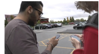
Figure 5. After the team received an instruction to disband, AW (right) and HB (left) simultaneously turn back and start walking back to the drop off zone, displaying bodily alignment.

This episode begins with an instruction ( AW, HB -> 44 ) from the agent. At that moment, there were 5 players at the drop off zone (AR, KD, LC, HB, AW). Immediately after the instruction, HB starts looking for AW in the local group. Shortly after, AR and HB team up to go for 44 as instructed. However, 13 seconds later the team is interrupted with a HQ message telling them not to go for 44 ( Target 42 and 44 is not reachable ). Four seconds later, a conflicting agent instruction was delivered, implying they disband the team ( AW, KD -> 44, HB, AR->31 ) but still pursue the target 44. At first, AW stops walking and topicalises the instruction ( AW: I got a new instruction ), followed by both teammates simultaneously turning towards each other (Fig. 5). The bodily alignment in the action suggests agreement to follow the new instruction. On their way back to drop off zone, HB and AW confirm their intentions (HB: I need to team up with AR , AW: I need to team up with KD! ). In this case, the teammates respond to the interruption by mutually agreeing to abandon the current team and task in favour of following the new assignment.